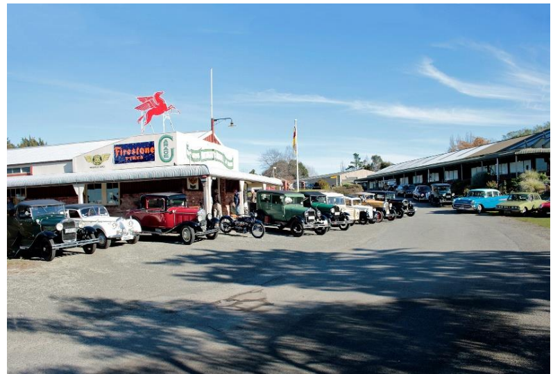
VCC Rooms Brayshaw Park

The whole park with all of it's clubs & organisations which now number twelve are part of the Brayshaw Heritage Park.