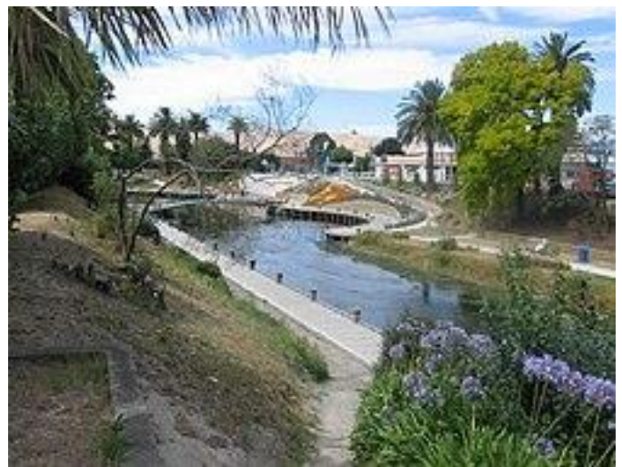
Figure 1 The Taylor River in central Blenheim

There are more than 30 wineries within easy driving distance of the town, and most of them welcome visitors for sampling sessions and cellar door sales. Character accommodation is a Blenheim speciality.