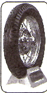
FIRESTONE BLACK TYRES 19"