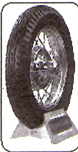
FIRESTONE BLACK TYRES 21"