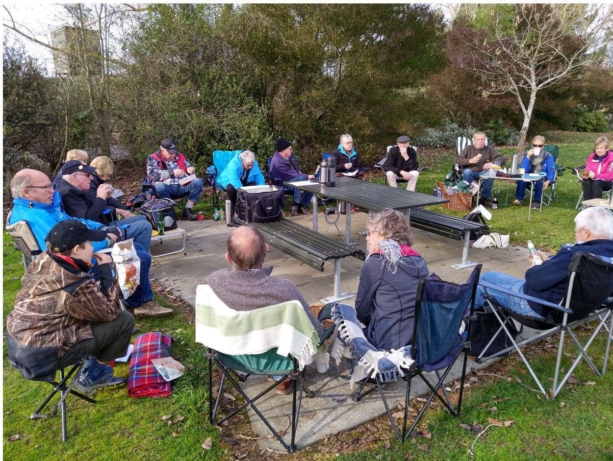
Picnic Lunch at Ashley Picnic Grounds

List of Rally Instructions & the 22 questions draws some puzzled looks!