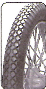
LUCAS BLACKWALL TYRES 30x3 \frac{1}{2} "