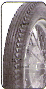
LUCAS BLACKWALL TYRES 19"