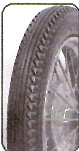
LUCAS BLACKWALL TYRES 21"