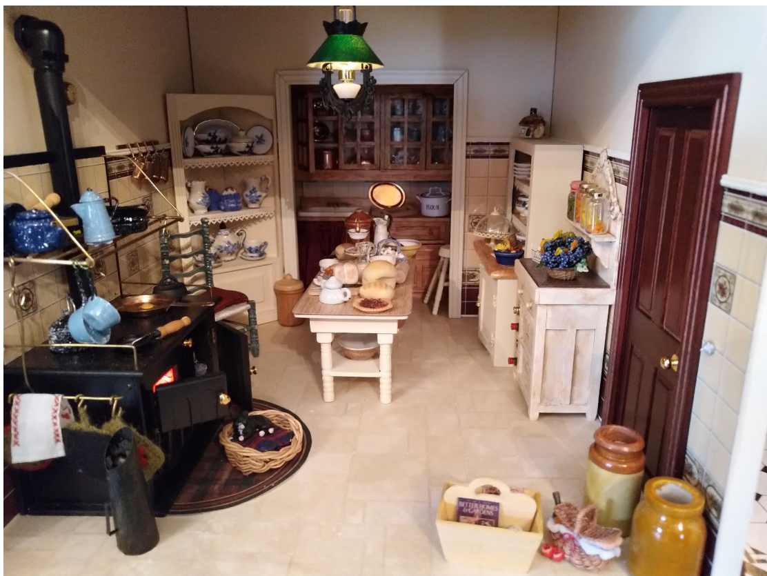
Looking inside you could have mistaken this for a full sized country kitchen