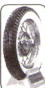
FIRESTONE WHITEWALL TYRES 19 OR 21"