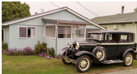
Hut 47 Bruce Ave Selwyn Huts

The Selwyn Hut settlement now consists of 96 batches of which nearly 100 residents call this their permanent home.