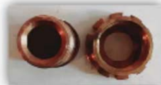
The other end of A-8520-A is chamfered to aid in the compression of the gland packing to the shaft.