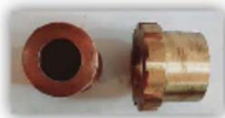
The rear of the bronze bush A-8520-A acts as a thrust surface for the pump impeller teardrop washer.

nut tools available. Wind it in and the packing will compress a lot, where a second length will most likely have to be added. You must have at least 4 to 5 turns plus on the nut to be effective to stop water leakage, and preferably more. The rear bushing A-8520-A has a thread of 20tpi NF and is a bronze composition.