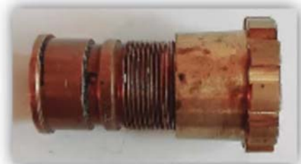
A-8520-A rear bush with gland nut.