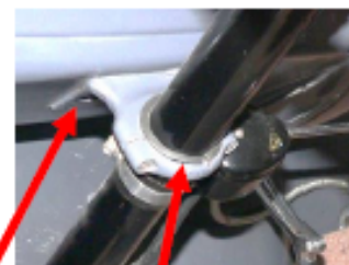
Tank can weep here.

If you can smell gas and still not detect a leak from the gauge, check the steering column clamp where it meets the gas tank. This area is prone to undue stress, especially if the clamp rubber has gone hard and lost its shock absorbing effect. The only real remedy if the tank is weeping, is to remove the tank for repairs. Try your local radiator shop for repairs. The joint may have to be re-riveted and soldered.