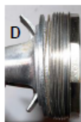
Outer nut in position, with slip rings behind.