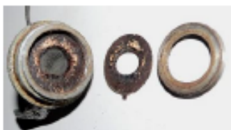
Inner gauge ring removed, showing gauge face plate and the remains of a cork gasket.

1" square bar is ideal to remove the inner ring.