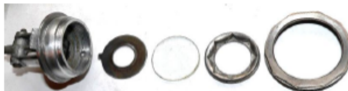
Gauge components less gaskets.

Screw down the outer ring firmly. With the inner ring tool, hold the inner ring in position to keep the gauge level. Get some assistance to undertake this.