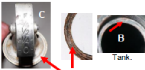
Grooved surfaces arrowed.

Both inner and outer rings are nickel plated. Chrome will completely spoil your restored dash panel which is also nickled. Purchase a 'gas gauge' overhaul Kit. You will need a new cork float, a face plate, a gasket set, and brass slip rings. All this should come in a complete set, but check with the supplier. A modern plastic or brass float can be use if you do not wish to use cork. Clean up all the old parts. Try to use the old glass lens if possible. (Some replacement glasses are plastic yuk.) Two surfaces which must be clean, are the back of the gauge and it's mating surface on the actual tank. They are grooved as pictured below. Clean out the grooves with a fine point.