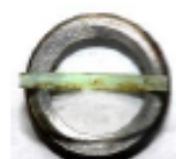
Gauge glass showing thickness of 3/32" x 1 1/8"

Insert the complete gauge into the tank opening against the large cork gasket, arrowed in blue , picture 'E'. Screw the outer ring onto the tank pushing the gauge against the cork gasket keeping the assembly level. Picture 'D'. This is important. Do not tighten this outer ring firmly just yet. Install the first small gasket, very lightly smeared with treacle. Install the glass gauge lens, followed by another small cork gasket very lightly smeared with treacle. Then the face plate suitably slotted into the hole at the bottom of the inner thread to keep it square to the gauge. If the two previous gaskets are too thick, the face plate will not fit correctly.