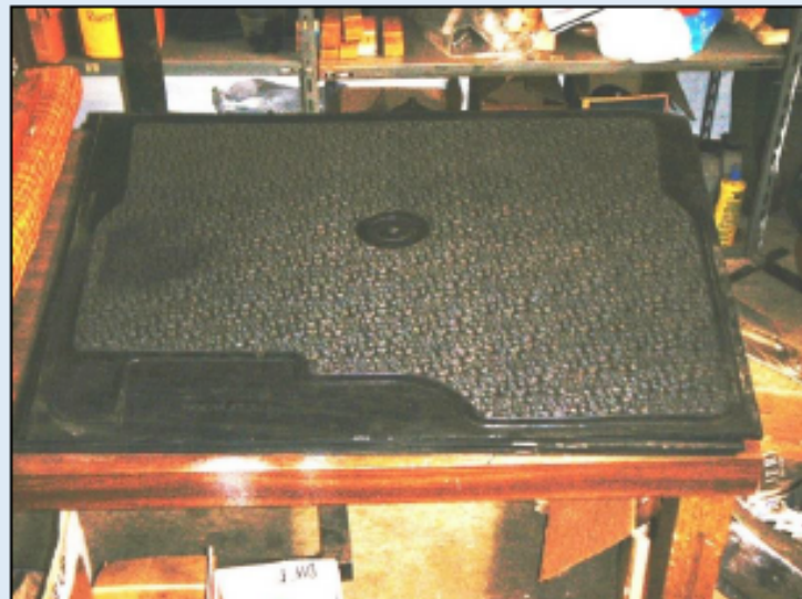
Pressed mats before trimming.

I also made the small RHD pedal mats and most were sold in conjunction with the floor mats. I know I sold more pedal mats than floor mats. I always thought I had sold more pedal mats than there were RHD Model 'A's.