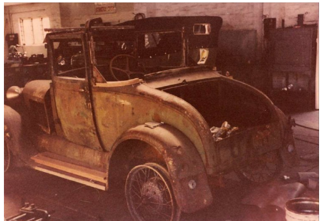
(Below) Wes Hartley and Beverley Biggs' 1928 Sports Coupé (Model 50A) as it was circa 1975