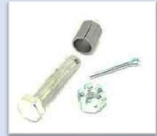
Mounting bolt, ferrule, nut and pin.

The rear mounts are rubber mounted and after some time (normally quicker than you think) the rubber hardens and transfers vibration. The complete front mounts are isolated from the chassis and the mounting bolts are isolated through the rubber by small ferrules. Bolt nuts are pinned externally as pictured. A side external plate holds the rubber to the engine mount as pictured. Most mounts were a casting, but some later mounts were a heavy pressing. The whole system works quite well if installed correctly.