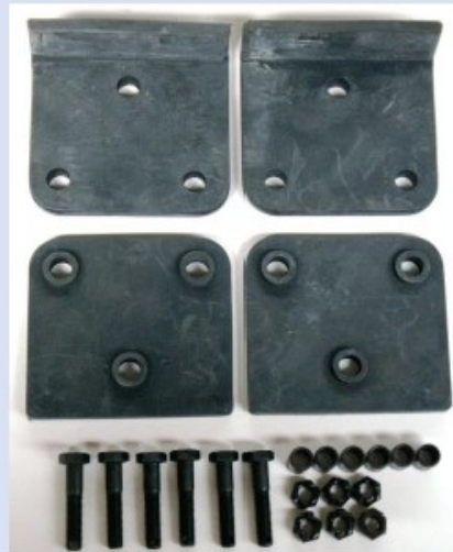
Complete rear mounting kit.