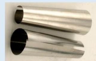
Pair of shims. One per axle.